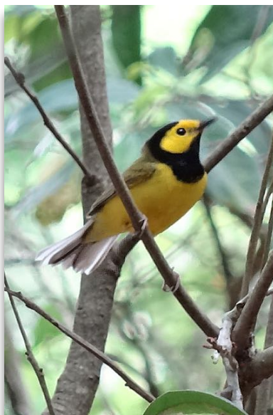
Hooded Warbler, Sea Rim State Park, Texas