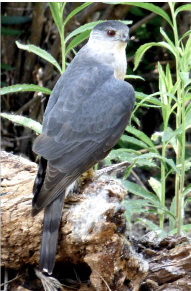
Cooper's Hawk, Patagonia, AZ