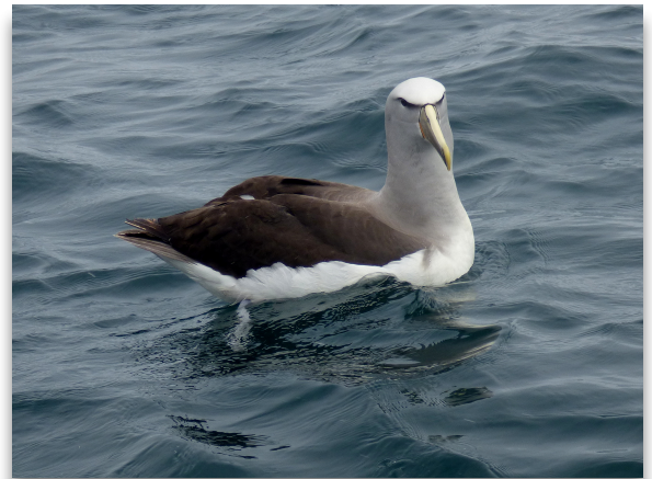
Buller's Albatross in New Zealand