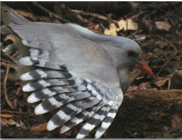
Monsieur Koko, a fairly tame Kagu in New Caledonia, an endemic bird.