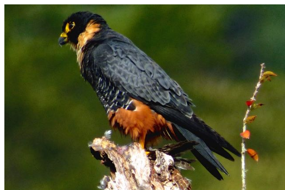
Bat Falcon, a favorite photo subject, Colombia. Another 5-star sighting of this bird.

Holiday Greetings to all of you, best wishes for a happy and prosperous 2015. The more detailed ANNUAL REPORT will be available at hargrove.org before the end of February, 2015.