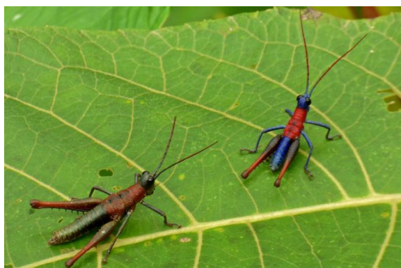
Male and Female (?) Grasshoppers in Colombia.